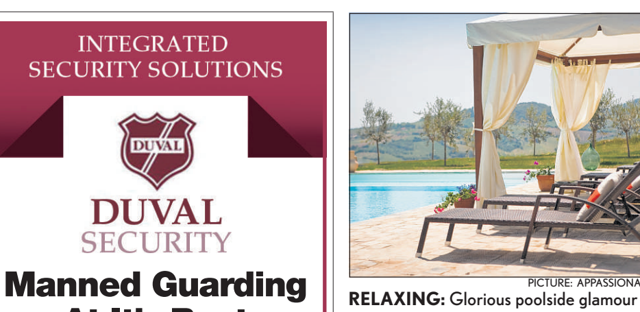
At It's Best