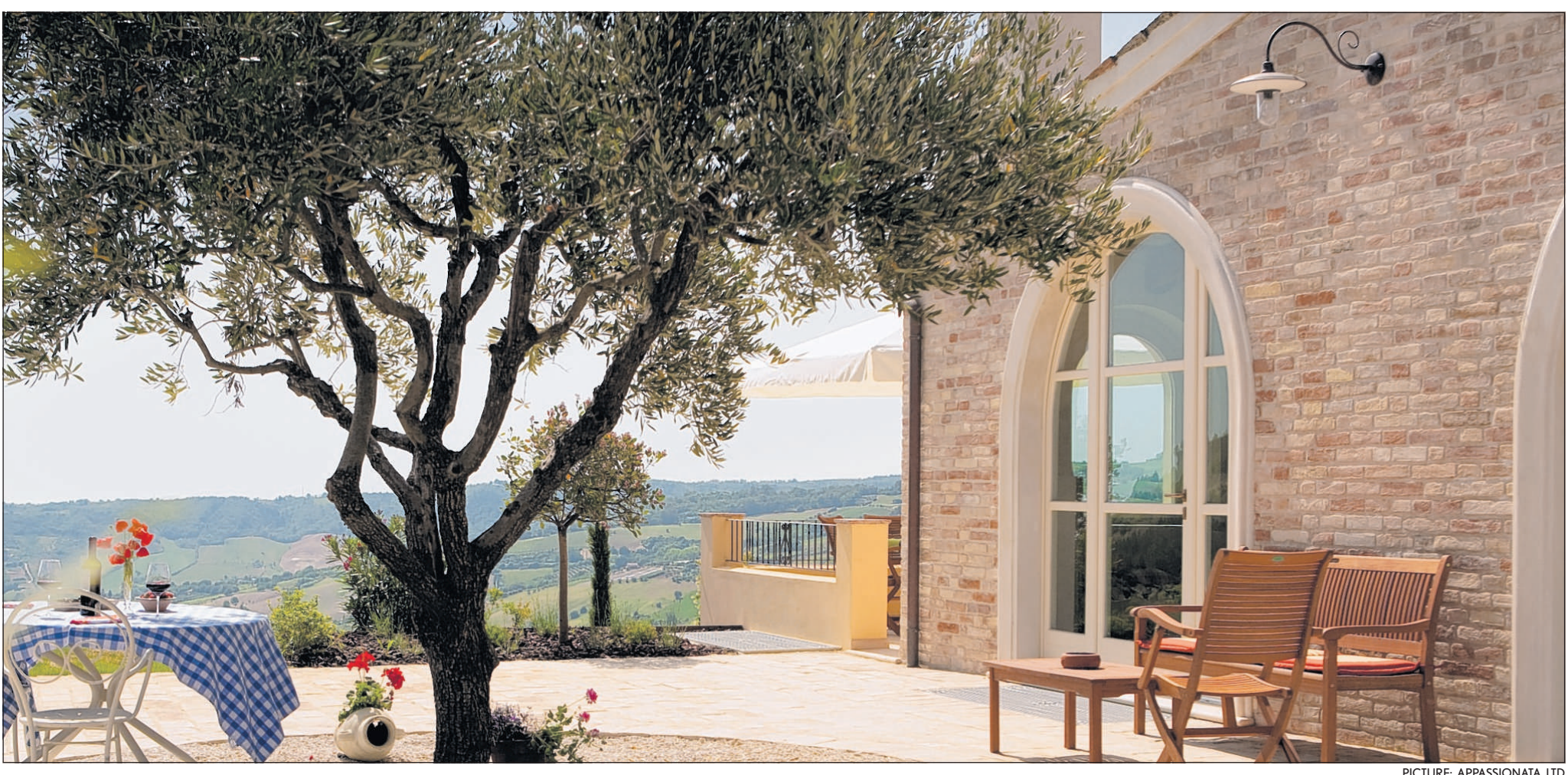
SPELLBINDING: Imagine stepping out onto this terrace every morning for breakfast. Casa Giacomo's terrace boasts wonderful views and the gnarled olive tree only adds to the rustic Italian feel